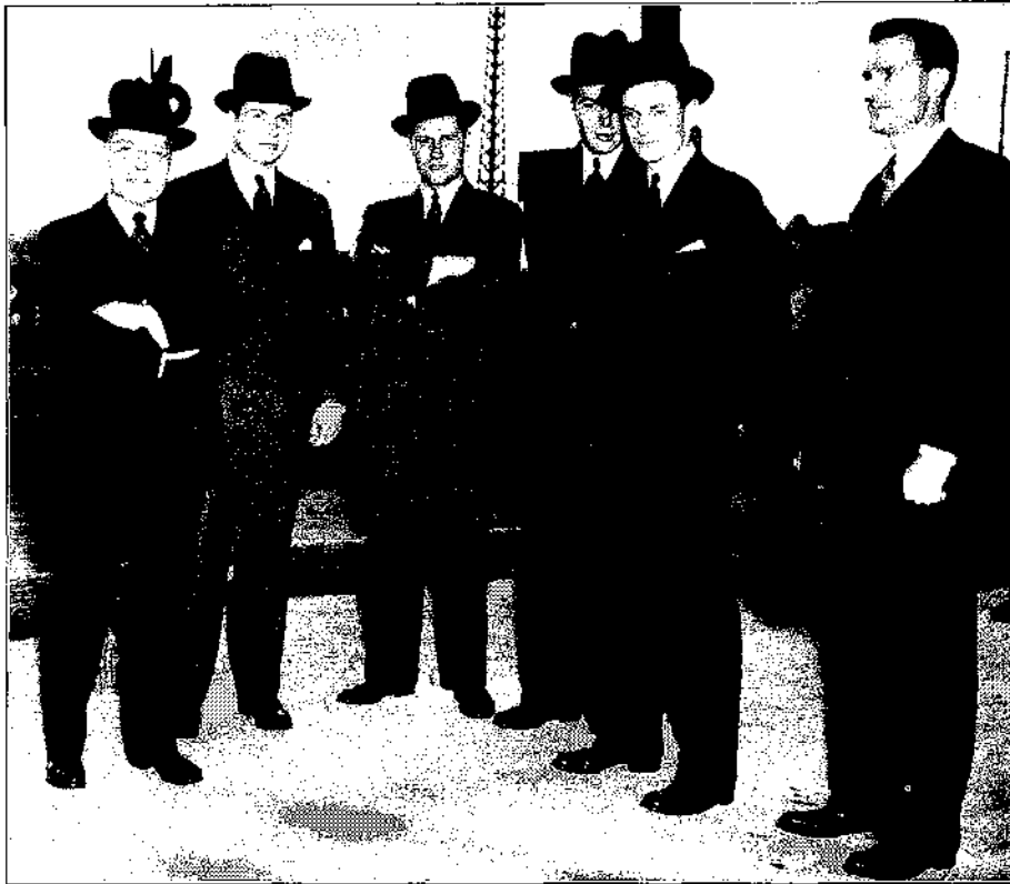
John D. Rockefeller Jr. with his five sons in 1937. From the left: Mr. John Davison Rockefeller; David (b. 1915); Nelson Aldrich (b. 1908); Winthrop (b. 1912); Laurance Spelman (b. 1910); John Davison, 3rd (b. 1906).