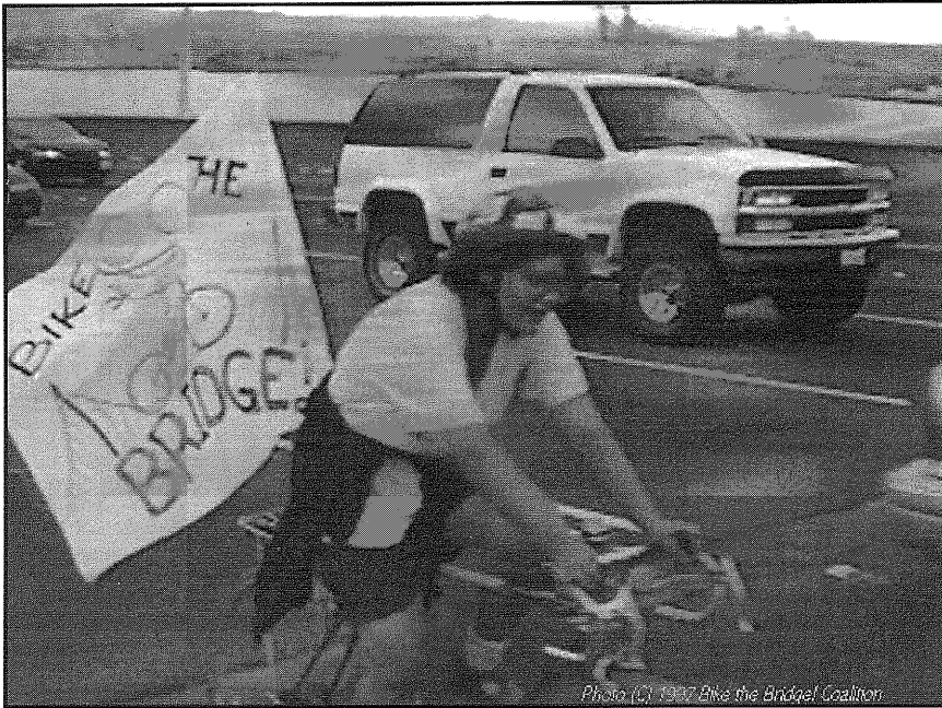
Image captured on video of a bike rider with the Bike the Bridge! Coalition, an advocacy group in the San Francisco Bay area. The rider demonstrates the group's support for open access for bicycles on bridges. The Coalition monitors design and safety issues and engages as necessary in acts of civil disobedience.